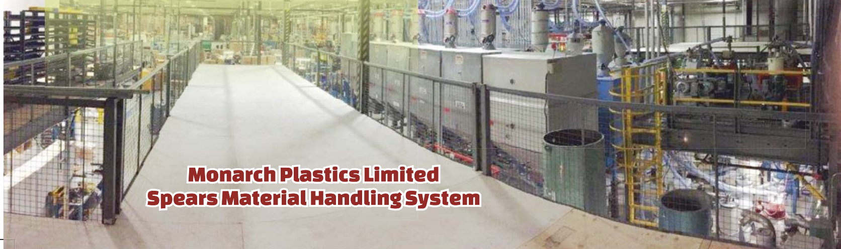
Monarch Plastics Limited Spears Material Handling System