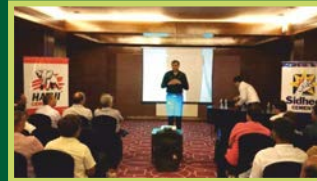
Presentation Session in progress during the Business Meet at Ahmedabad