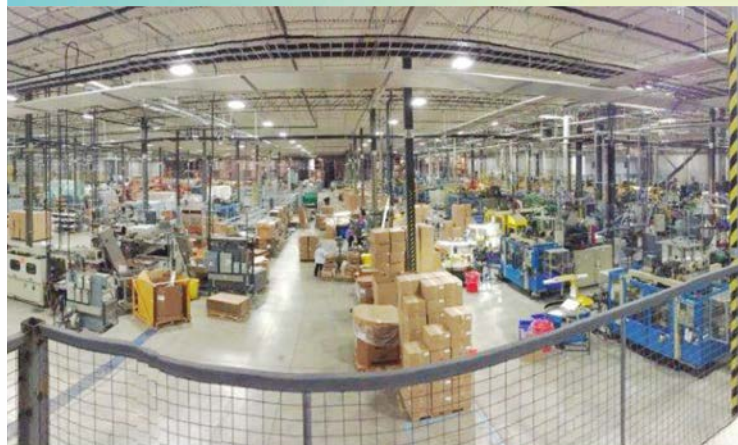
Monarch Plastics Limited at Spears Panorama Plant view