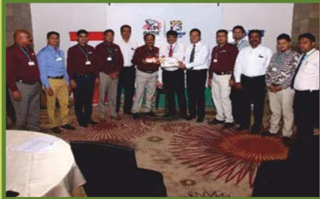
Best Management of Rebate & Incentive Trade FY 2015-16: Rajkot Region