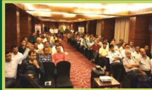
Business Meet - Ahmedabad Dealers

The awards were given to the Star performers in the Meet.