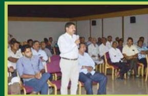
Channel members sharing their views on business growth during the meet at Bhavnagar