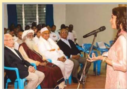
Ms Juhi Chawla introducing the Sadhguru to the gathering at Lugazi

On 10th June, 2016 he gave a mesmerizing talk at the Pentagon Hall about raising one's inner self in the yogic way and to lead a blissful life. About 200 employees of The Mehta Group including locals and expats gathered to listen to the Sadhguru.