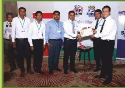
Best Management of Rebate & Incentive Trade FY 2015-16: Junagadh Region