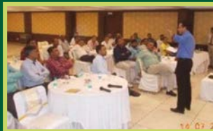
Business Meet – Baroda & Surat Region