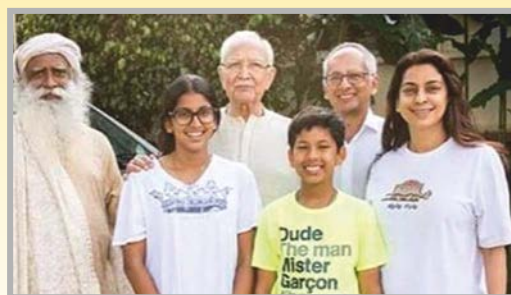
Sadhguru with the Mehta Family at SCOUL, Lugazi