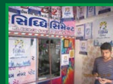
Sidhee Display: Junagadh