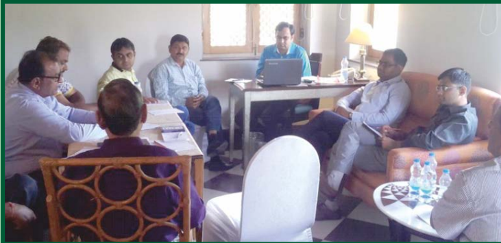
Bhavnagar MO Team at work to formulate specific targets and growth plan