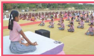
World Yoga Day celebration at SCL, Ranavav

Yoga, which has been practiced in the country for centuries, received global recognition after the United Nations declared June 21 as the International Yoga Day, a proposal that was initiated