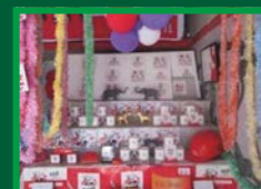
An outlet in Rajkot artistically used Hathi Model for display