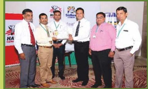
Best Management of Commission Non-Trade FY 2015-16: Surat Region