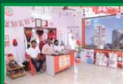
Hathi Display: Bhavnagar Region

Shop Display Contest "Rang-de-Dukan" among Channel Partners was organized to promote creative displays and brand visibility through Posters, Banners, POS, Stationary items etc.