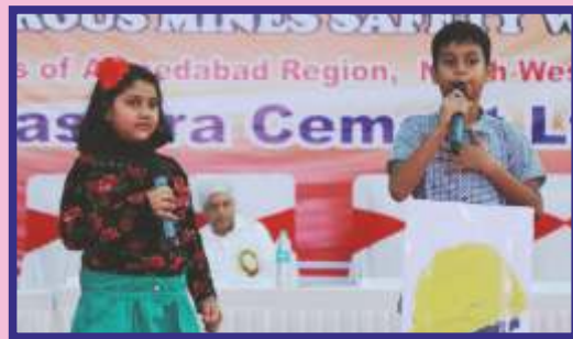
Children giving message on Mines Safety Week