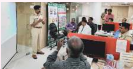
Experts like Doctors and Traffic Police were also called to share their advice and knowledge on Safety.