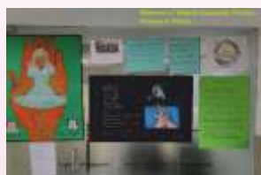
Best selected Safety Slogans & Posters