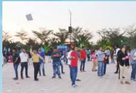
The event witnessed full participation by family members of our Channel Partners

Hathi Sidhee Kite Festival-2016 (Patangotsav) was organized at Ahmedabad for all region dealers from - Ahmedabad, Baroda, Surat and Mehsana. This Carnival theme based event was best enjoyed by our channel partners and their family members.