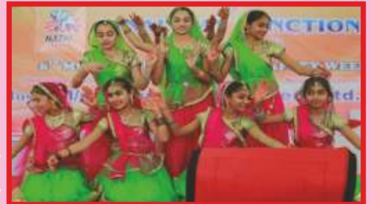
Cultural Program performed by students of SCL Vidya Vihar School

The inspecting Director General of Mines Safety-officials ranked the participating Mines under various prize categories. 125 Trade prizes for individuals and 85 prizes of category-wise ranking of Mines were awarded by the dignitaries. SCL owned Adityana Limestone Mines and Marl Mines won the first prize in Mines Lighting & Electrical Installation, Best Stall and in Overall Best Performance. Ran Bauxite Mine - SCL won second prize in Haul Road Maintenance and Transportation. Our members won several prizes for their individual excellence in trades like Blaster, Mechanic, Drill/Compressor Operator, Excavator/Loader Operator and Dozer Operator.