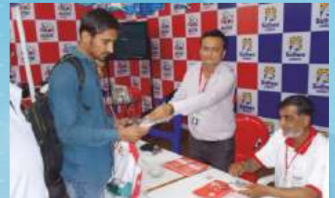
Hathi-Sidhee put its Stall at 'Sthapatya' Exhibition in Surat

Participating in exhibitions offers an opportunity to meet with prospective buyers and in showcasing our products to architects, engineers, builders, contractors, consultants etc. who hold leading position in endorsing our Cement.