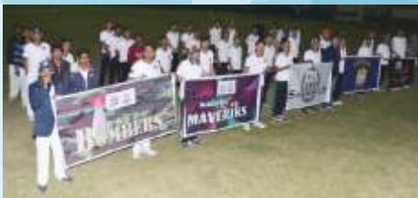
All the five cricket teams with their banners

Aimed at inculcating sportsmen spirit in the marketing teams, Hathi Sidhee Intra Cricket Championship Season-2 matches were played in February at Ahmedabad. The Regional marketing staff was divided into 5 teams : Ahmedabad Attackers, Saurashtra Shooters, Baroda Bombers, Marketing Mavericks and Kathiyawadi Kings. Exploring their competitive skills and team spirit, finally the trophy was won by Kathiyawadi Kings triumphing over Ahmedabad Attackers in the final match.