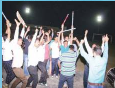
The winning champions dance in joy celebrating their victory