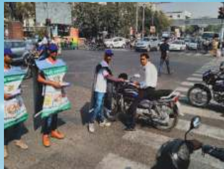
Road Shows were organized at major crossroads to promote Safety. Human Banners were used effectively displaying safety messages.