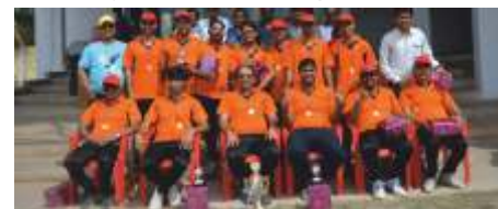
The winners – Gupta Gladiators with their trophy

SCL Plant organized Saurashtra Cricket Premier League-2016, from 10th January to 21st February, 2016. 6 teams participated in this tournament. The Final Match was played between Gupta Gladiators and Rathore Riders, where Gupta Gladiators emerged as the winner.