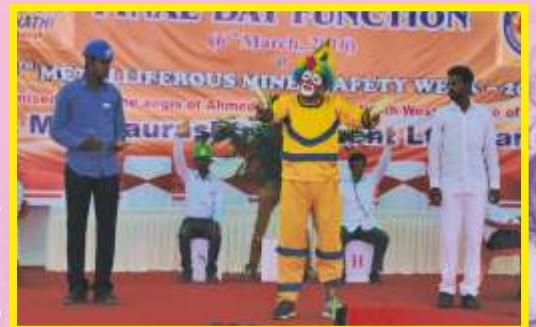
Skit performed by SCL employees on the theme 'Ae Bhai Zara Dekh Ke Chalo'