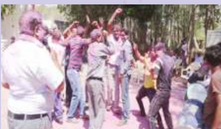
Holi played at GSCL Plant

"HOLI" - the festival of joy and colors was celebrated with enthusiasm and gaiety at both the plants on 'Holika Dahan' and 'Dhuleti'. All the employees and their families enjoyed Dhuleti, a carnival of colors wherein they chased and applied colors and squirted colored water. At the end, everybody enjoyed a tasteful drink of thandai.