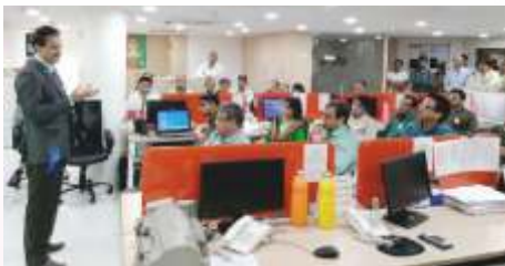
Director-Marketing & Sales advising the staff members on Safety

On the occasion of National Safety Day observed on 4th March, Mehta Group Marketing offices celebrated Safety Week between 26th Feb to 4th March. During the period, Health and Safety Awareness was created through various ways – Safety Oath, Presentations, Slogan writing, Poster making, Road Shows, Site Displays, Mock Drill, Quiz, Skit, etc. Safety themed display boards / posters were used as visual reminders for everyone at workplace to motivate and always practice safety.