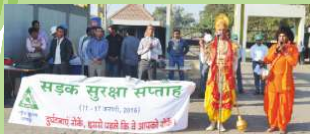
Skit played by SCL employees on Road Safety

SCL & GSCL Plants celebrated 27th Road Safety Week from 11th to 17th January, 2016. Different programs like walkathon, poster competition, safety slogan & essay, quiz, rangoli competitions etc. had been organized to bring about awareness on road safety amongst employees and people in surrounding areas.