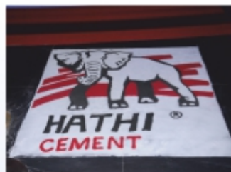
Brand logos were represented in the form of Rangolis.