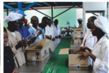
Spirit packaging team