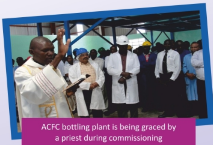
ACFC bottling plant is being graced by a priest during commissioning

The new Extra Neutral Alcohol Plant has rejuvenated ACFCs' market presence. This has been manifested through the latest additional product lines – Bottled Spirit and Carbon dioxide plants. With the commissioning of these plants, avenues for extension into new areas have been opened for ACFC's future expansion.