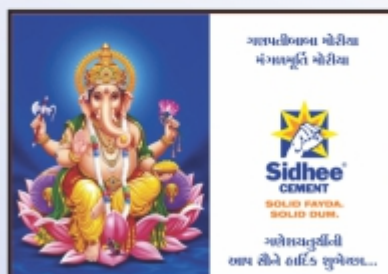
Theme Based Festival Poster - Ganeshotsav