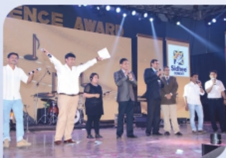
Channel Partners also participated in a song of unity: "Mile Sur Mera Tumahara..."