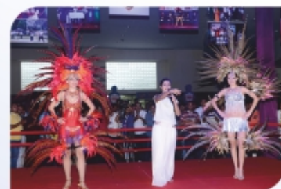
Channel partners enjoyed live performance of Rio Carnival Dancers at the Pre-Convention Area.