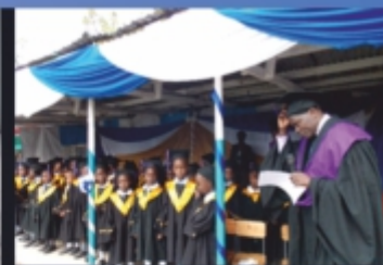
Education – ACFC Kindergarten School Children at a graduation ceremony