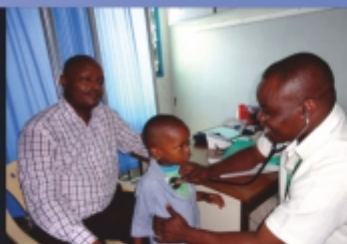
Company doctor at work at ACFC dispensary.