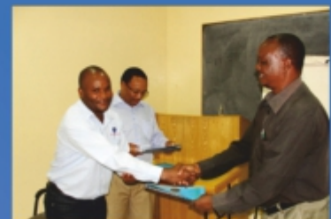
Participants being awarded certificates at ACFC training center

Since inception, ACFC has always maintained a healthy organizational culture that supports corporate objectives. ACFC has achieved various milestones in its journey that includes a recent rating of overall "Excellent" by the State Corporations. These accolades have been realized due to its commitment in effective training of staff in various skills required in modern technological advancements, staff welfare facilities, spiritual nourishment of employees through annual prayer day, sound corporate social responsibilities and free & clean water to the community etc. The employees and local community has also played an important role in achieving these goals.