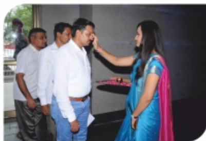
Invitees were welcomed with tika and arti in a traditional manner.