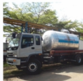
First fleet of Co2 tankers raring to go

The plant will be expected to produce 3000 tons of compressed liquefied gas annually for sale to beverage manufacturers and 1000 tons of Carbon dioxide will be used towards production of solidified Carbon dioxide / dry ice for industrial applications.