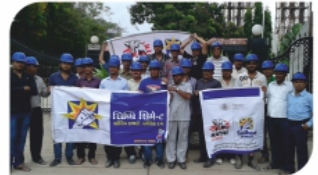
Factory Visit of the channel partners