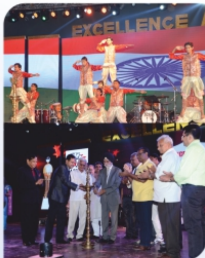
Event was inaugurated with lighting of lamp by eminent dignitaries, followed by Ganesh Stuti and National Anthem