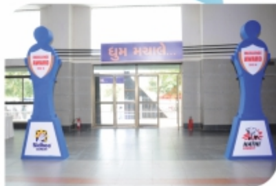
Grand Entrance of the Venue