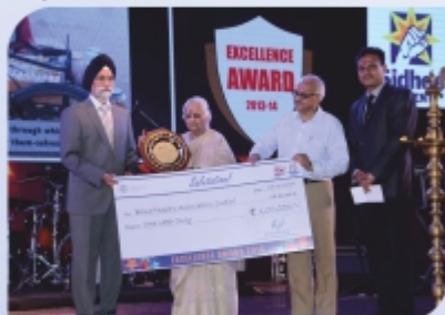
BPA (Blind People's Association -India) were felicitated by The Mehta Group for its remarkable contribution towards society.