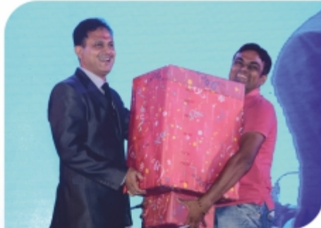
Rang De Dukan Winner