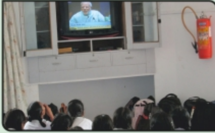
Students watching Indian Prime Minister Mr. Narendra Modi's Speech on Teachers Day.

N. K. D. A. V Public School, Sidheegram celebrated Teacher's Day on 5th September 2014 with much enthusiasm and exhilaration to commemorate the birthday of Dr. S. Radhakrishnan the former President of India. The entire school was under the control of students Class-X who managed the whole school systematically and diligently without leaving a chance of any perplexity. The day was filled with fun and frolic as the students arranged number of competitions among the teachers to make the occasion a most memorable one. All the teaching and non-teaching fraternity whole-heartedly participated in the program. The Principal in her speech appreciated and congratulated the students for displaying their leadership and management qualities and also advised the students to show excellence in their future endeavors also.