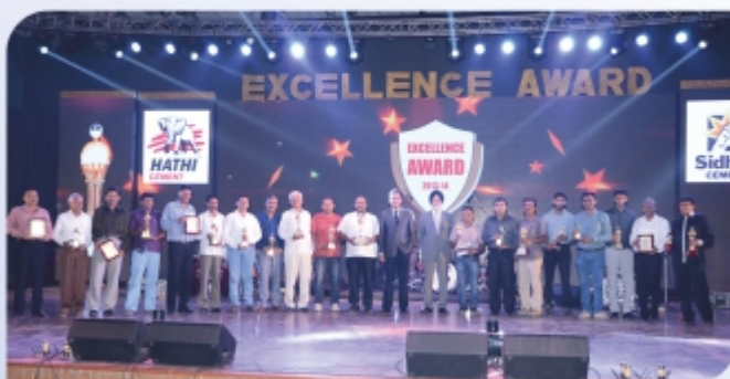
Group photograph of all the Winners