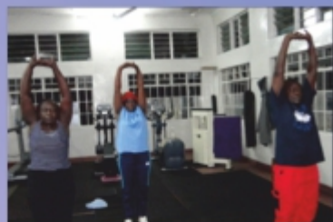
Healthy living – staff members at ACFC gymnasium.