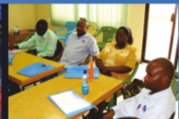
Training session in progress