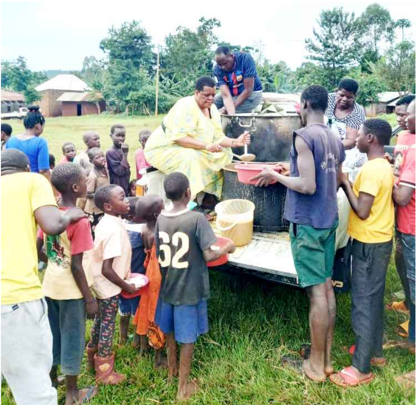
Distribution of clothes and food along with other essential items.

It gives us immense pride to share that our team at SCOUL, Lugazi in Uganda has been doing remarkable work in helping the residents of Lugazi Municipality with a hearty distribution of clothes and food along with other essential items.