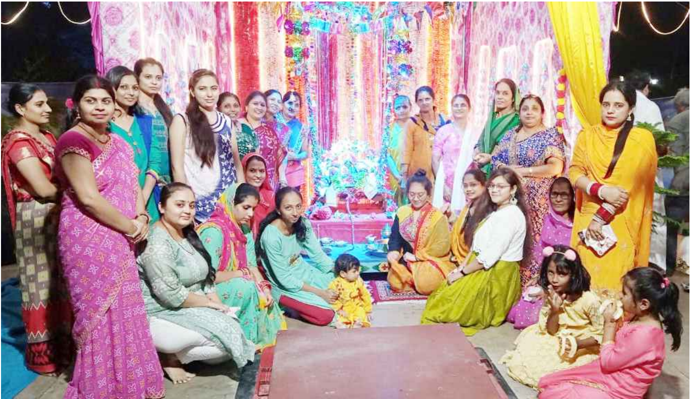
Janmashtami Celebrations at GSCL, Sidheegram