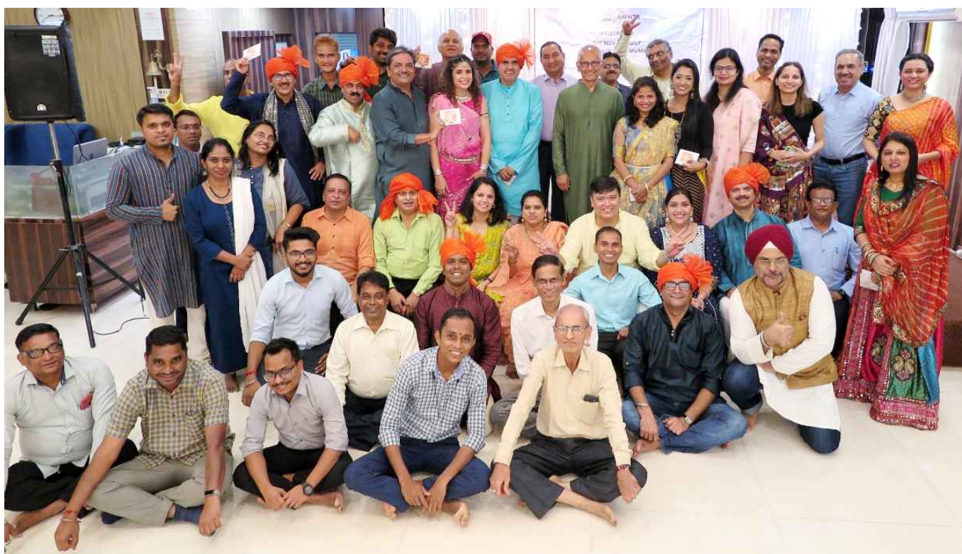
Navratri at Corporate Office, Mumbai