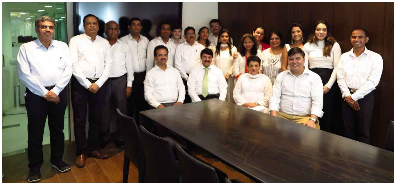
Navratri Celebrations - Day one of Navratri starts with white colour which symbolises peace and serenity which is followed by our Corporate Office, Mumbai