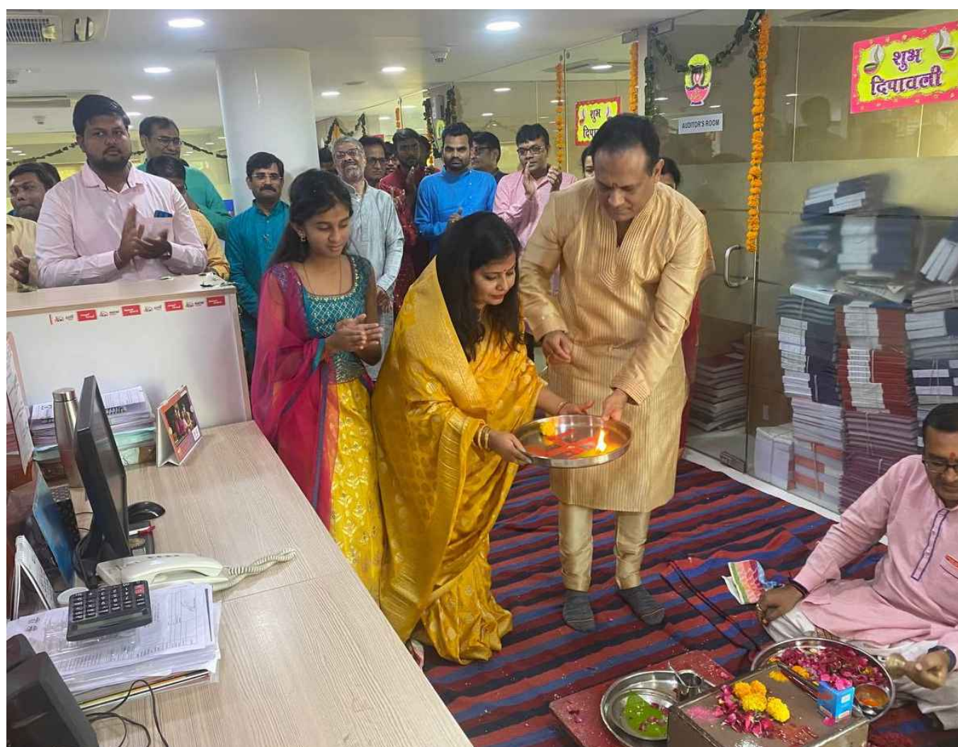
Diwali Pooja at Marketing Office, Ahmedabad