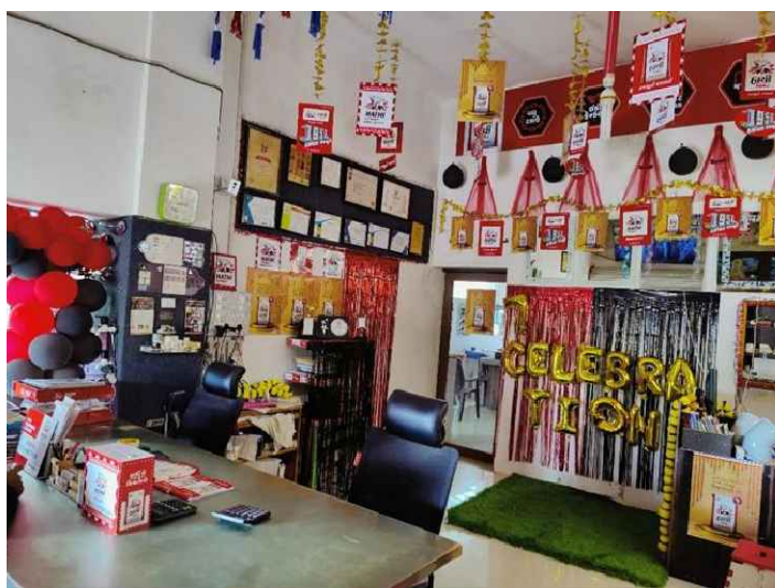
Krishna Iron & Cement, Baroda

Some innovatively decorated images of shops/ offices of Rang De Dukaan :