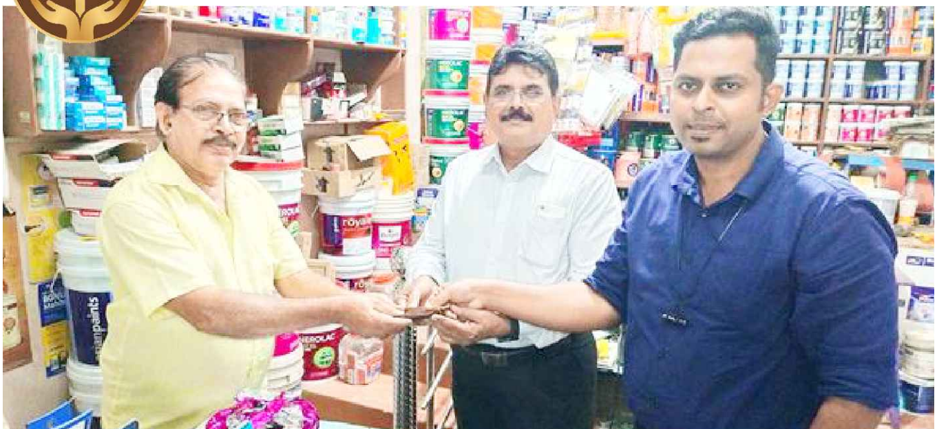
Lali Paints – Trivandrum