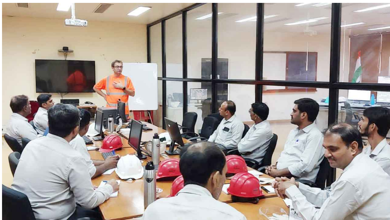
Technical Training being conducted at SCL, Ranavav

A Technical Training programme, spread over four days was organised for both the Plants, SCL and GSCL. In all, 24 team members took part in the programme.