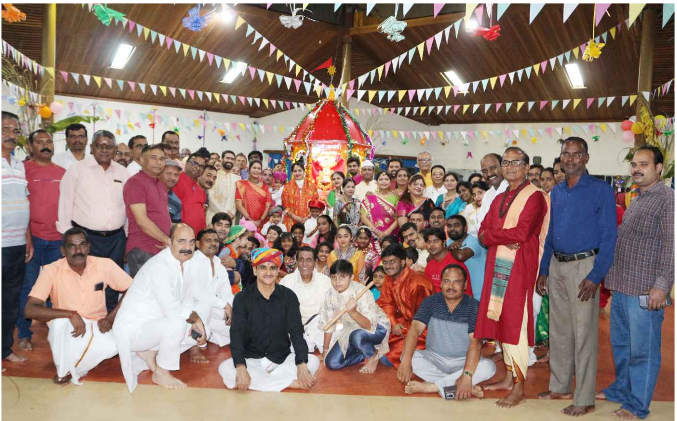
Navratri Celebrations at Lugazi, Uganda

On the 8th day of the Navratri function, all the employees and their family members came in their traditional outfits. A children's drawing competition along with a rangoli competition for women was organised in addition to a dancing and singing competition.