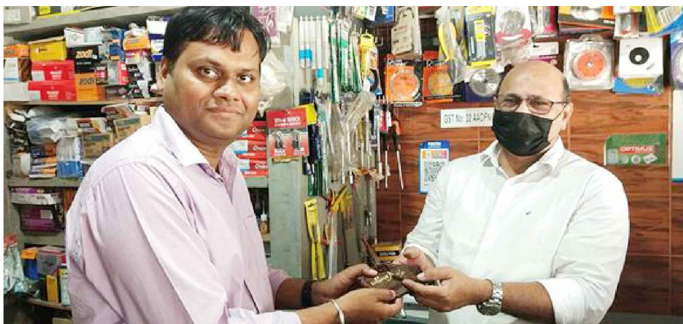
Nas Enterprises - Calicut