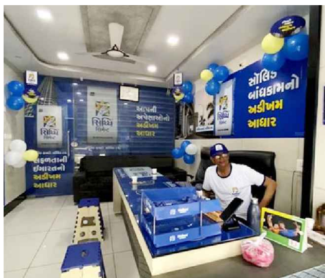
Satyam Tiles, Bhavnagar