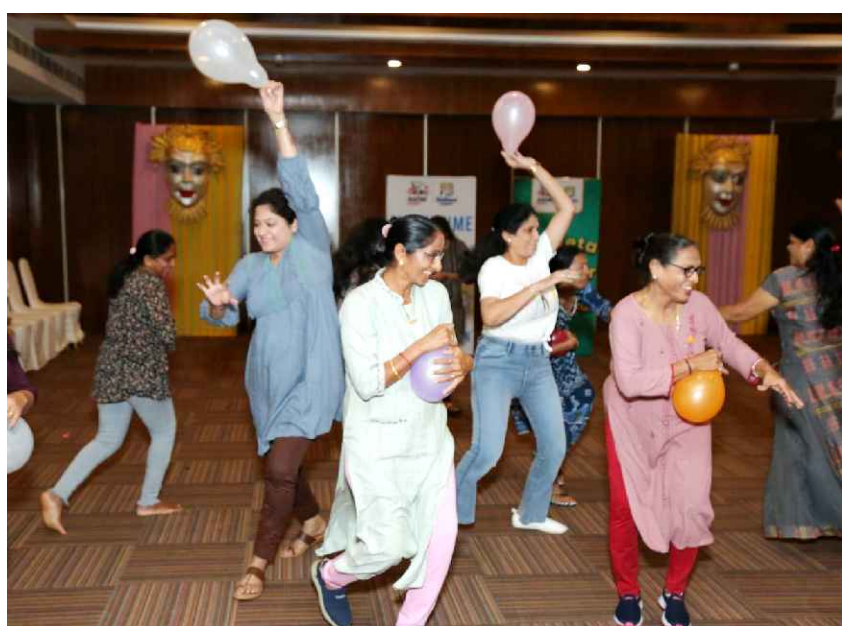
Ladies enjoying fun activities