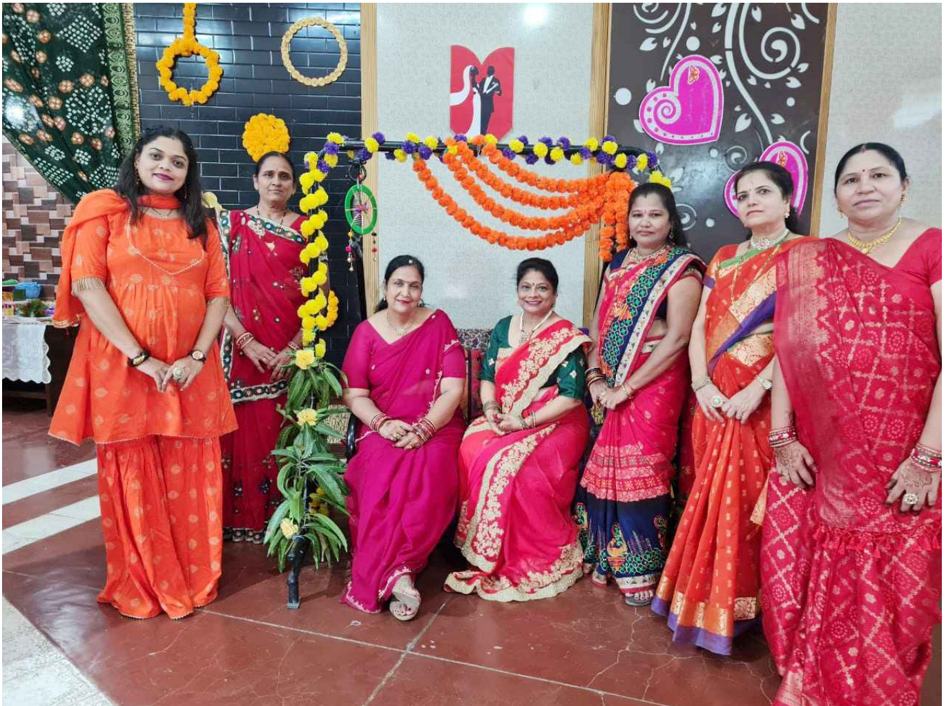
Hariyali Teej Celebrations at GSCL, Sidheegram

A grand celebration was held by the Sidhee Ladies Club for Hariyali Teej Utsav with activities that included games, Teej Queen competition and much more.