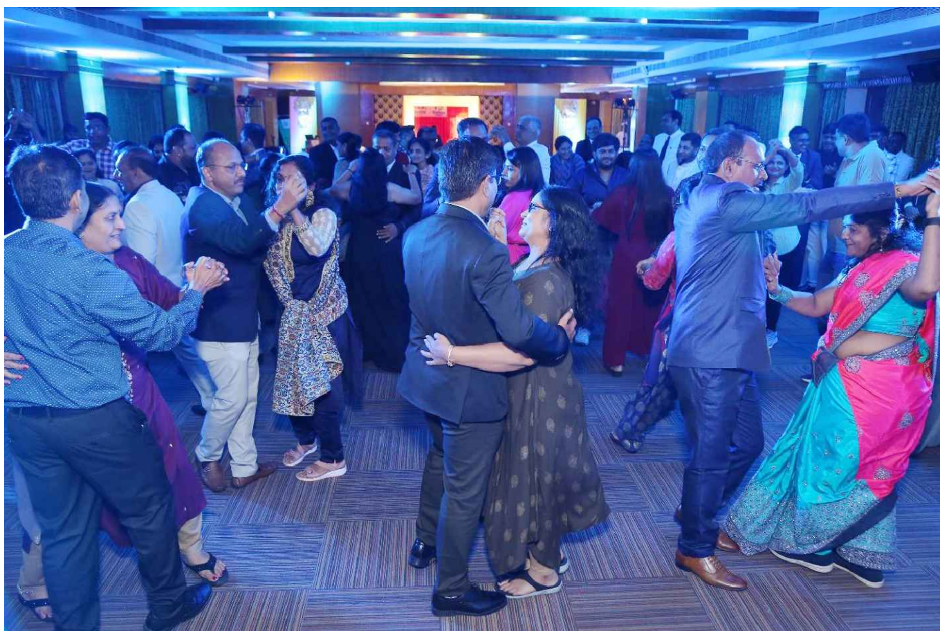
Dealers dancing with their Spouses