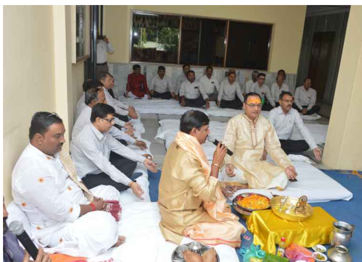
Chopda Poojan at SCL, Ranavav