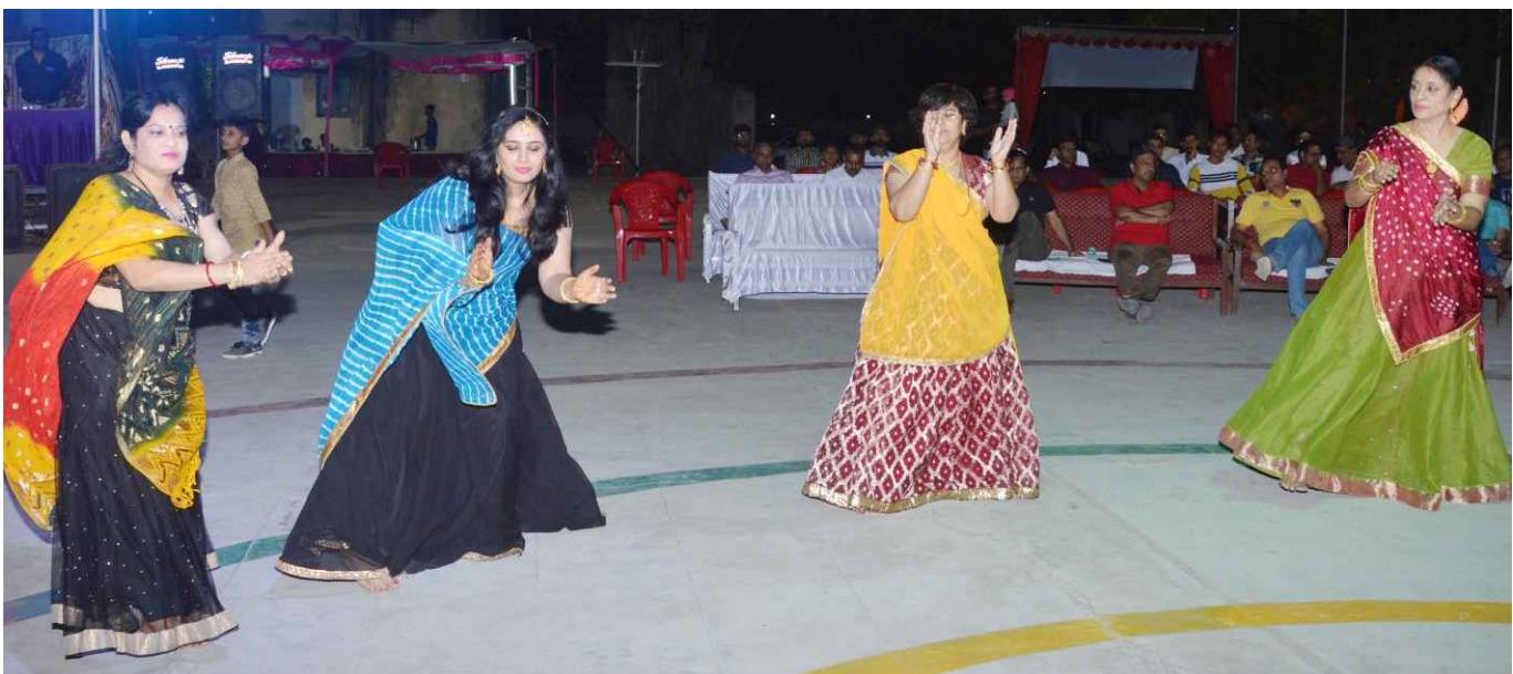
Garba dance being played at SCL, Ranavav