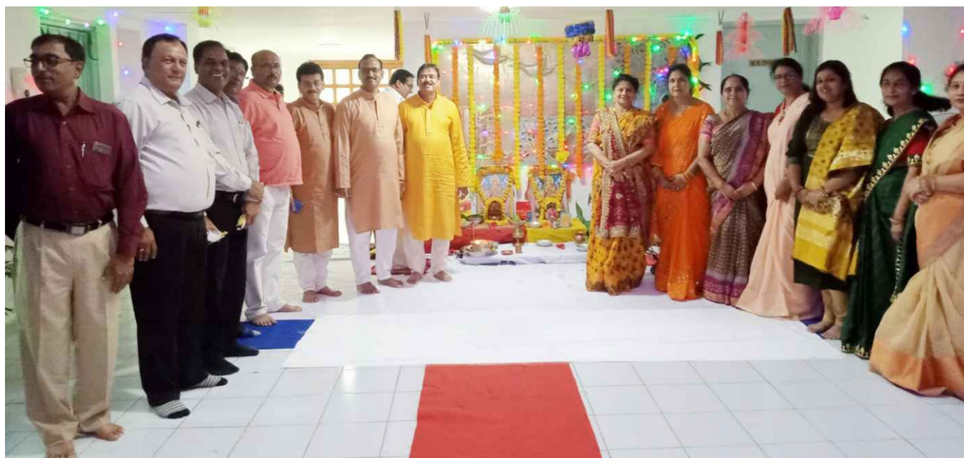
Diwali Celebrations at GSCL, Sidheeagram