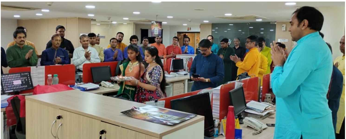
Navratri Pooja at Marketing Office, Ahmedabad

All the team members were seen excited to be a part of the celebration. Kick-starting the function with short pooja ceremony, all members enjoyed playing garba, matching steps and most importantly having fun together as a family.