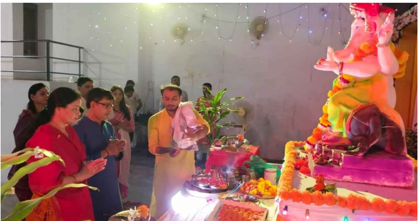
Ganesh Pandal and Celebrations at SCL, Ranavav

SCL, Ranavav and GSCL, Sidheegram celebrated Ganesh Mahotsava with fervour, devotion and enthusiasm.