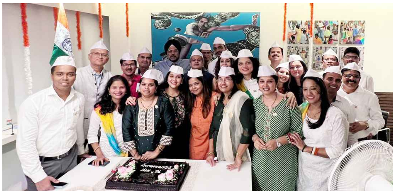
Team of The Mehta Group Employees' Club, Mumbai

A quiz contest was organized with questions on the Indian Independence Movement along with dance performances and a session of patriotic songs which were sung by the team members.