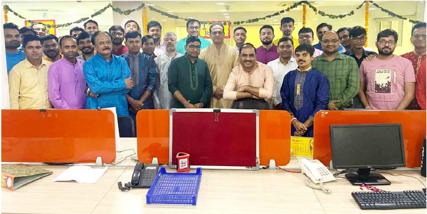
Diwali Celebrations by Marketing team, Ahmedabad

The pooja on Dhanteras was organized with prayers to Maa Lakshmi, amidst chants of the Priest and clapping by all people present, for welfare of company and individuals.