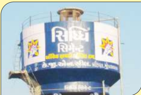
Attractive Brand displayed on High-Rise Water Tanks ensures visibility

Apart from the above brand displays, Vertical Display boards were also put up in all major dealer outlets in Gujarat.