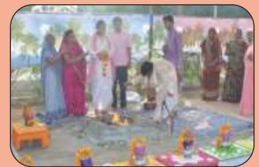
Dussehra Yagna (Hawan Ashtami)