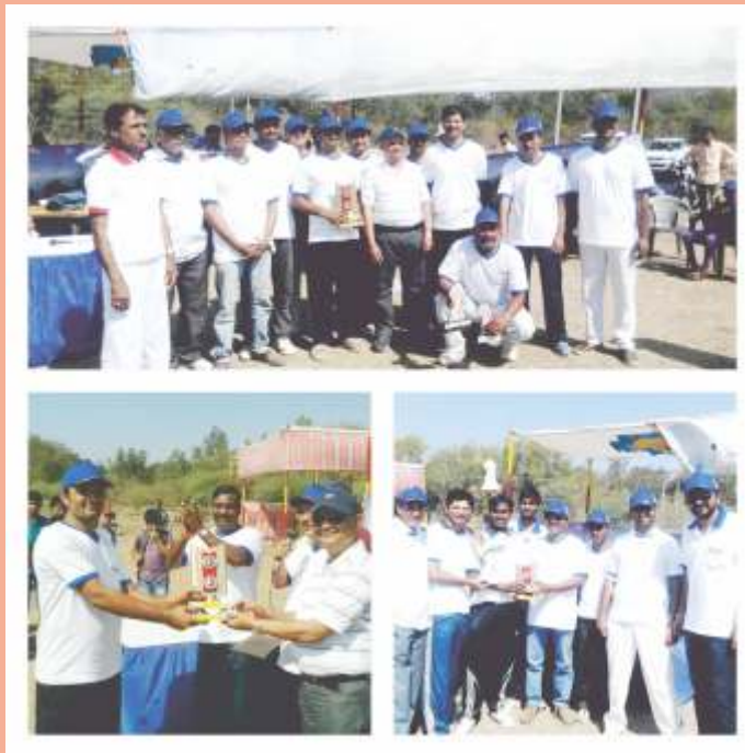
Friendship Cricket Match played between SCL & GSCL teams

A Friendship Cricket Match was organized by SCL at Ranavav on 22nd March, 2015. Sidhee and Saurashtra Cricket Teams participated in the match. Both the teams played the match with the spirit of unity and friendship with greater zeal and SCL won the match.