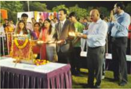
Maha Aarti offered during Diwali Carnival, praying for the auspicious New Year.

Deepotsav (Diwali Carnival) was celebrated on 20th October'14 at Rajkot. Saurashtra Region dealers wholeheartedly participated with their families to make it memorable. The event was full of various exciting games, activities, and dance sequence followed by Maha Aarti, which everyone enjoyed.