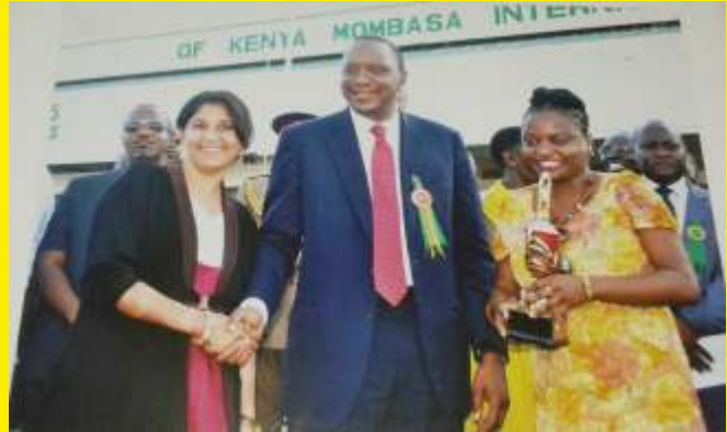
Teachers Receiving Awards From H.E. the President of The Republic of Kenya Uhuru Kenyatta for winning at the ASK Congress Arts Competitions