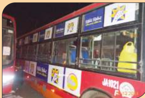
Ahmedabad Municipal Transport Services (AMTS) Bus Branding – Sidhee