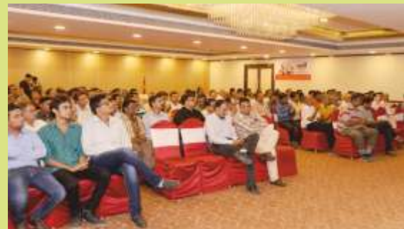
Seen in the pic: Members of ACCE (Association of Consulting Civil Engineers), Rajkot.