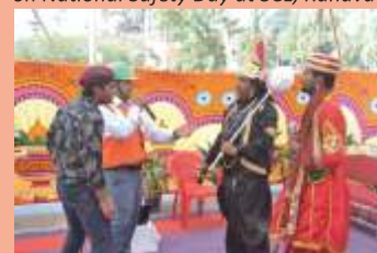
A theatrical drama performance on Plant Safety theme by employees of SCL Plant