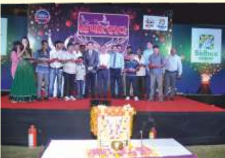
All participants and winners were felicitated with awards