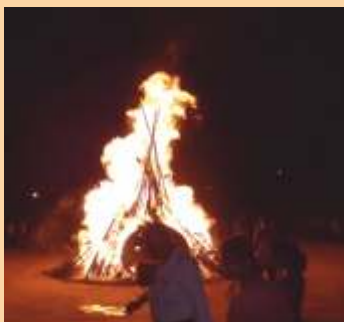
Bonfire was lit during Holika Dahan

The next day on Dhuleti, employees and their families sprayed water and applied colours to each other. Balloons filled with water were splashed on one another. Like every year, all colony residents participated in this joyous and colourful festival with great fervour.