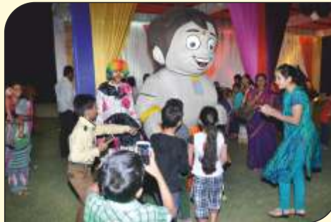
Dancing with their favorite super hero Chhota Bhim and displaying their talent on stage at the Deepotsav.