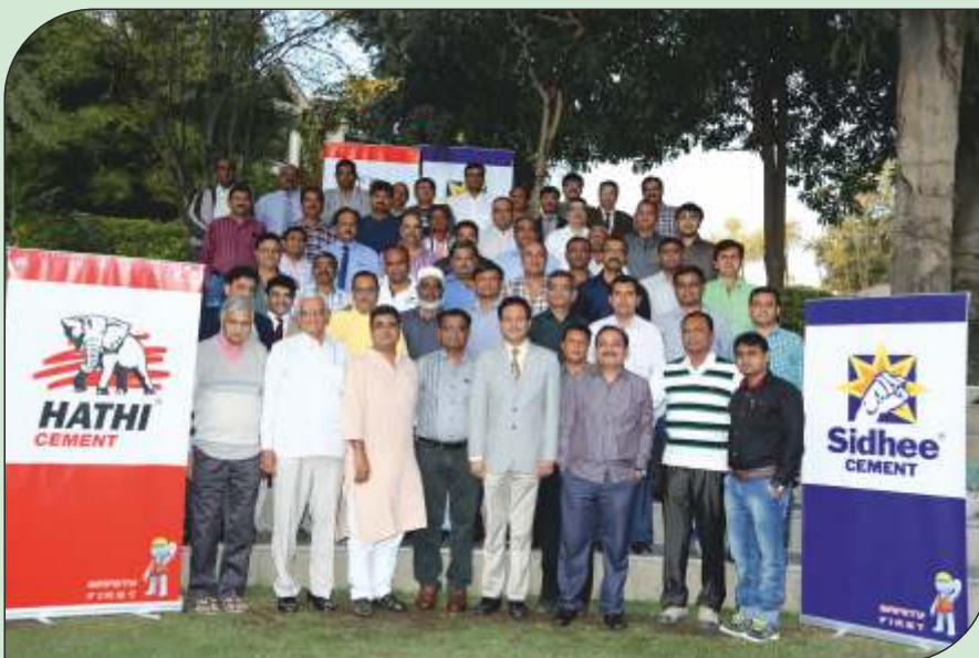
Market Organizers meet was organized at Mount Abu in December'14 to involve them in Strategic Planning Process.