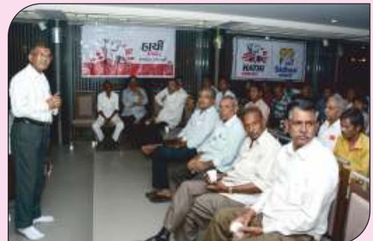
To strengthen association with potential contractors, regular meets were organized across all regions in Gujarat.