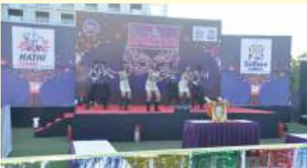
Dance performance by professional dance troupe