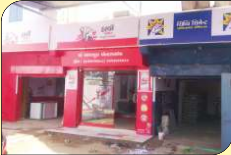
Attractive branded Shop gate adds to our Brand visibility