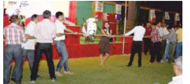
Dealers participating in tug-of-war

Dealers get-together was organized for Lucky Draw prize distribution at Rajwadu Restaurant, Ahmedabad on 5th Nov, 2015. The Lucky Draw scheme was meant for consumers & influencers. Bumper prizes - Royal Enfield, Honda Activa, LED TV, Refrigerator, Smart Phone and 25 other consolation prizes were distributed.