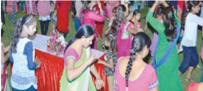
Families of the dealers performing on Garba tunes.