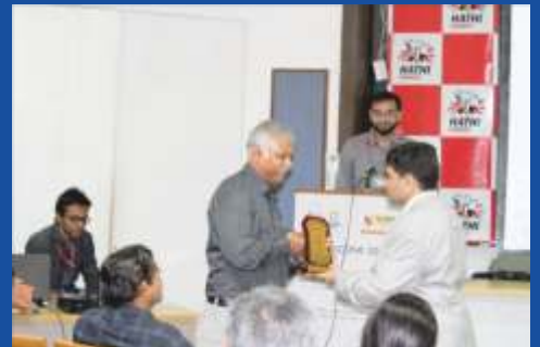
Hathhi-Sidhee Cement felicitated the dignitaries and speakers in recognition to their contribution in the program.