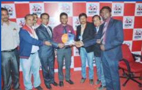
Team Mehta Group receiving award on behalf of our Company for participating in the Exhibition from PEATA Members.

Visitors take their time out to note the displays at our stall at PEATA Exhibition, Bhavnagar.