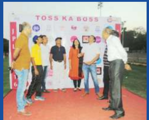
Tossing opportunity given to the competing teams.

Hathi participated as co-sponsors of Cricket Match organized by Jain Social Group at Gandhidham.