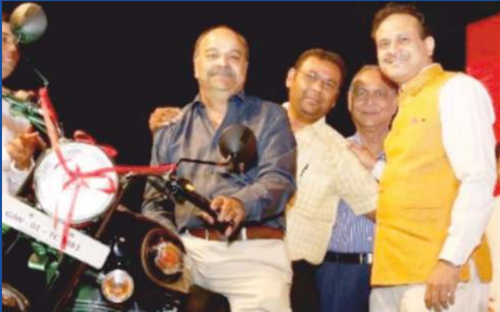
Winner of Bumper Prize – Royal Enfield & Honda Activa