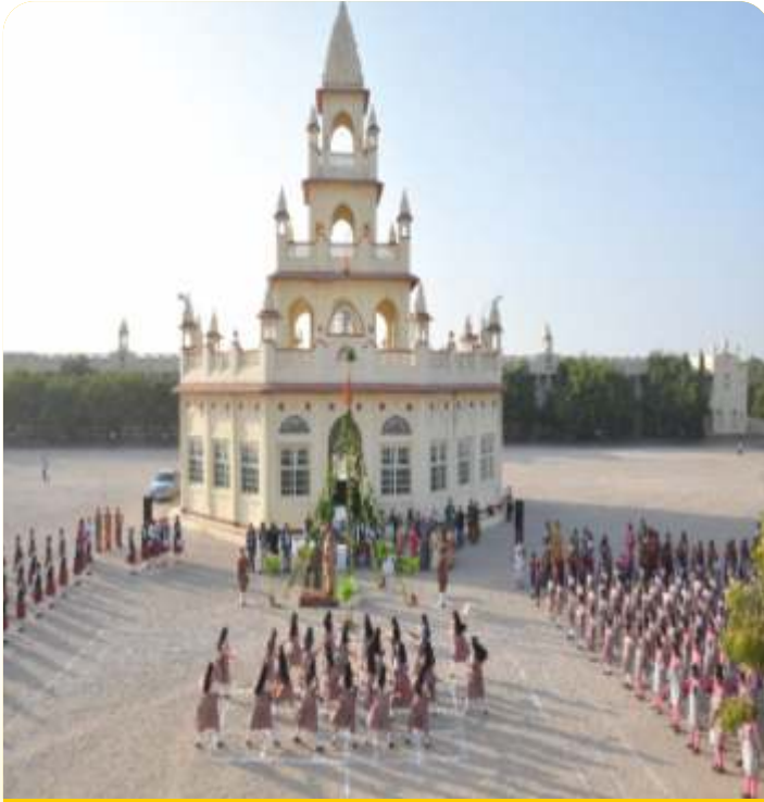
Flag hoisting ceremony on the occasion of 79th Annual Day of Arya Kanya Gurukul at Porbandar