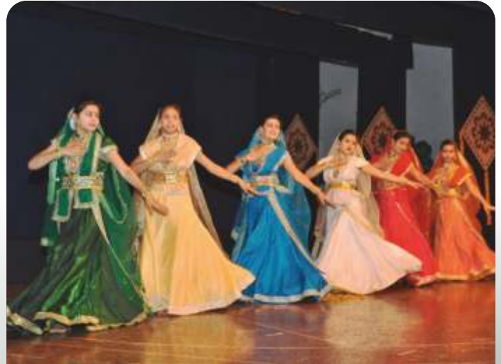
Classical Dance Performance by the students