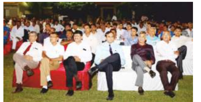
The Mehta Group team with Market Organizers