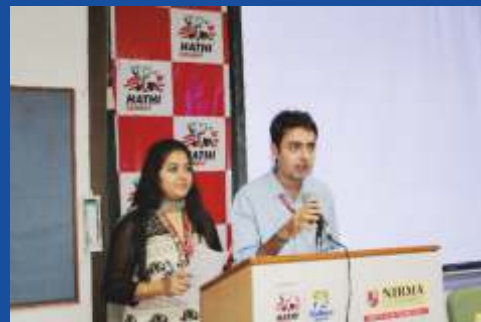
Participation by Civil Department Students of Nirma University at the event

These efforts help in establishing our brand equity and recall amongst the targeted focus groups.