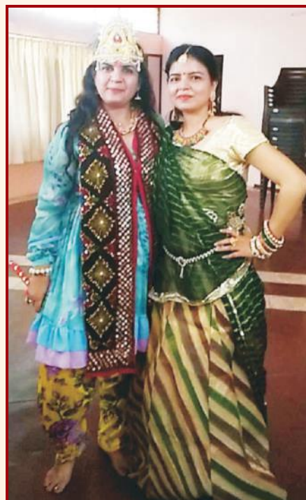
Janmashtami celebrations by Ladies Club members