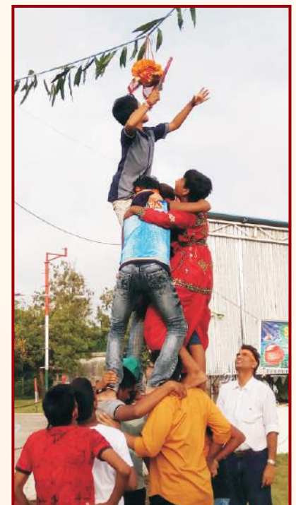
Dahi-handi celebrations at Sidheegram during Janmashtami