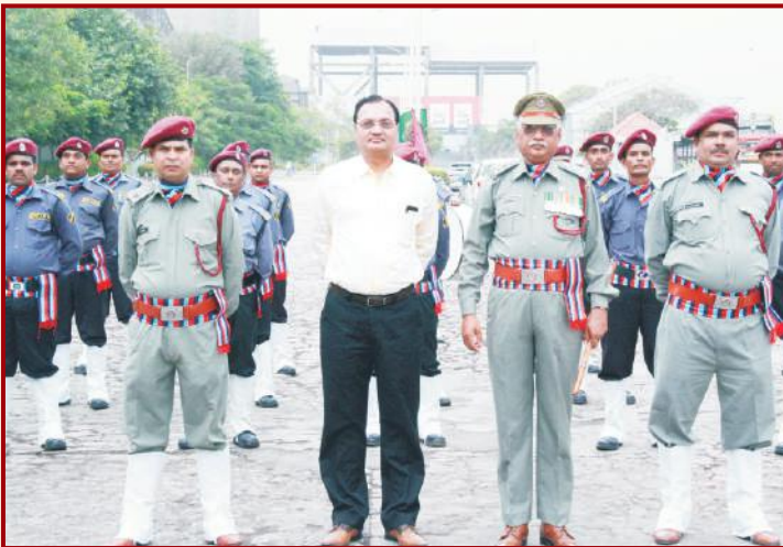
Independence Day Parade at SCL, Ranavav

The mood at our Corporate Office in Mumbai was upbeat with excitement and enthusiasm. Tricolour decorations adorned the office. The staff did their bit by sporting a metallic flag.