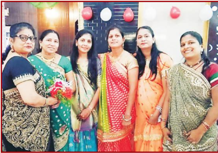
Group party by Sidhee Ladies Club