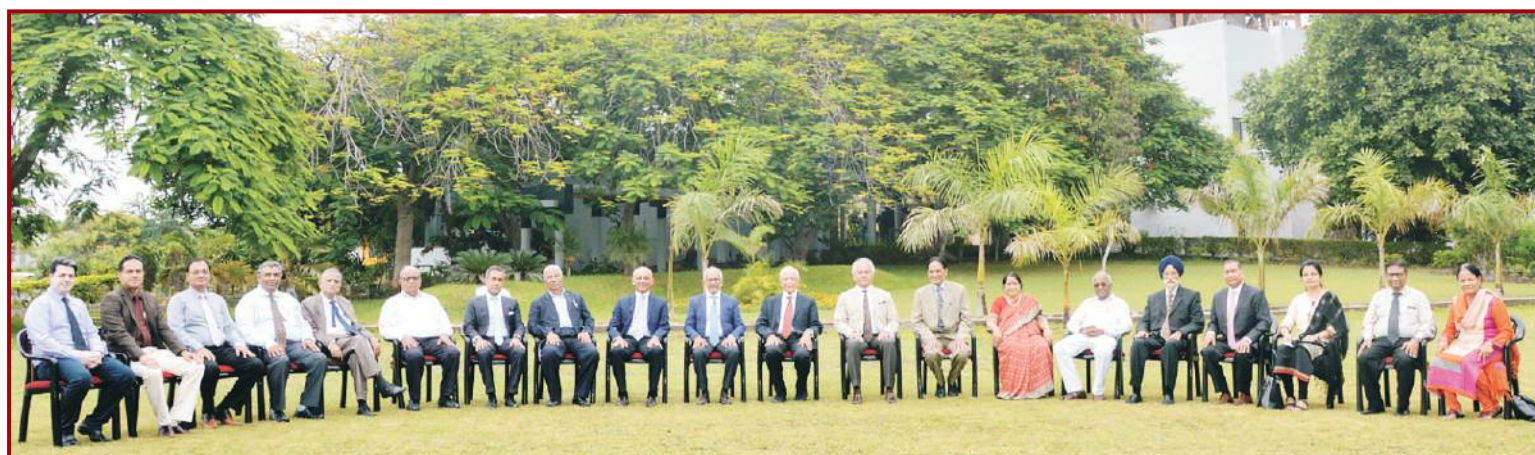
Board of Directors of SCL