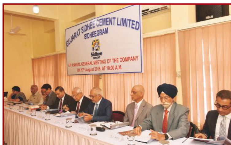
44th Annual General Meeting at Sidheegram

The 44th Annual General Meeting of GSCL was held on August 13, 2018 at Sidheegram.