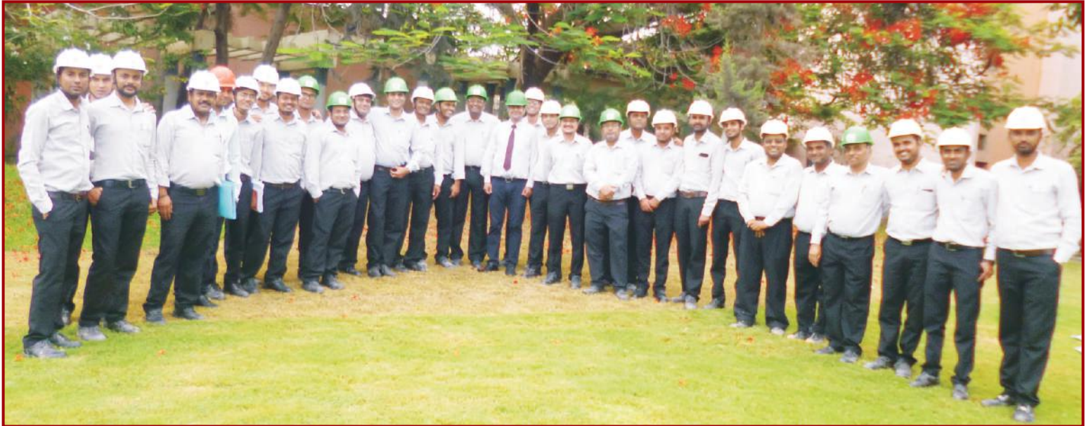
Participants of the IMS Internal Auditors Training programme at SCL, Ranavav

Learning is a lifelong process. Without learning and training, the growth of the individual and that of the company he is associated with is compromised. To cope up with changing dynamics of the market and keeping up with the technological advancement, learning and training remain imperative.