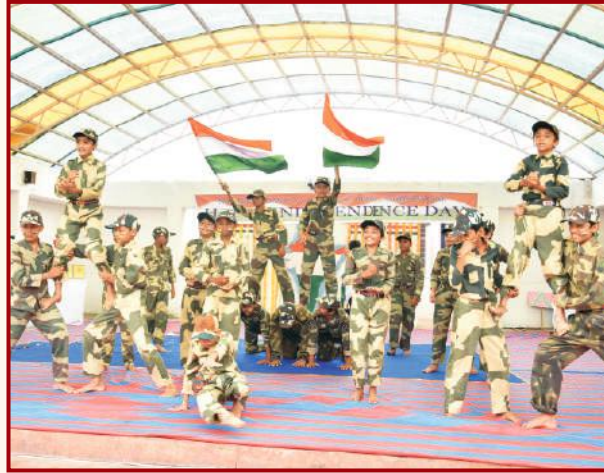
Patriotic dance performance by N.K.D.A.V. Public School students