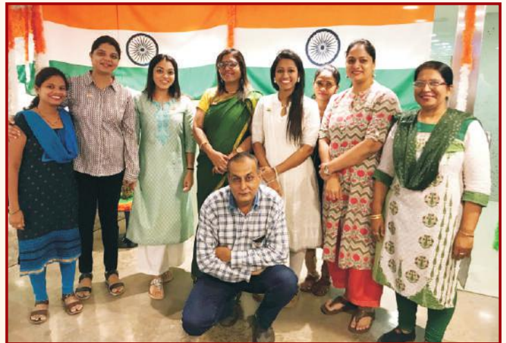
Independence Day Celebrations at Corporate Office, Mumbai