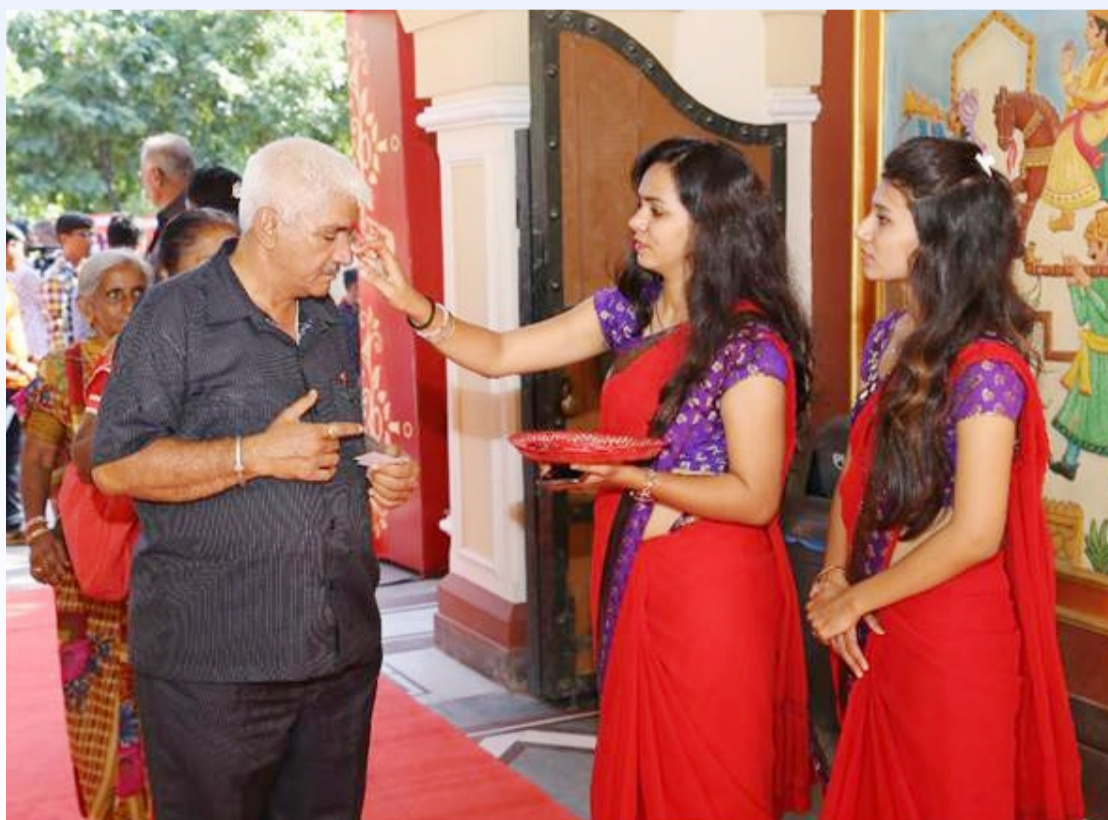
Channel Partners and their families were welcomed in a traditional manner

Continuing with the tradition from the last few years we enjoyed a day together with the families of our Channel Partners during the auspicious festive period of Diwali. Various activities such as Rangoli Competition, a game of tug of war, Chhote Sitare singing and dancing competition and many other such fun-filled activities made the event memorable.