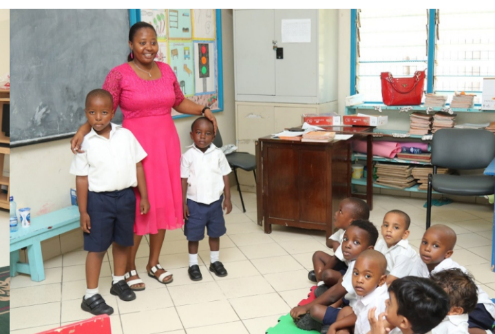
Santokba Nanji Kalidas Mehta Nursery School