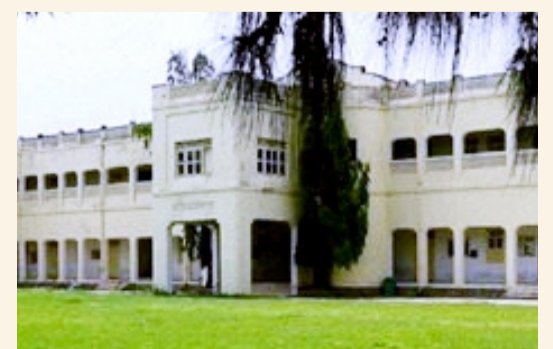
Gurukul Mahila College