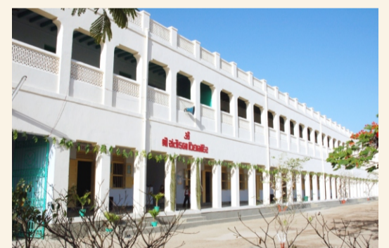
The Santokba Vidya Mandir