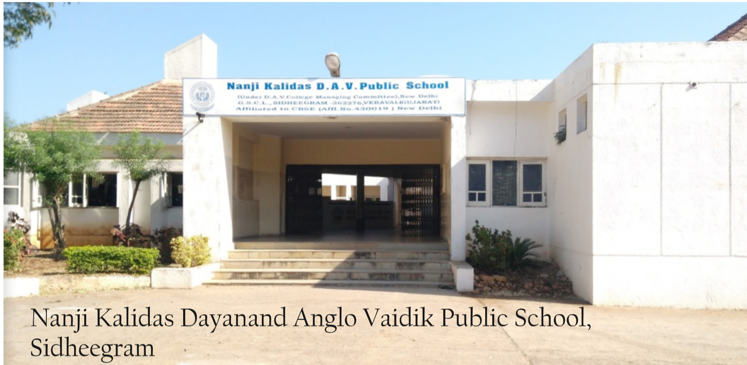
Nanji Kalidas Dayanand Anglo Vaidik Public School, Sidheeegram

Yoga, Physical and Health Education, Computer Science, Arts subjects are available to all the students. The school teachers and staff focus on ensuring an environment where students can freely imbibe the basic ethos of Encouragement, Excellence, Empowerment and Enlightenment and gain proficiency in competencies to enable them lead lives of honour, truth contribution to the society and the nation.