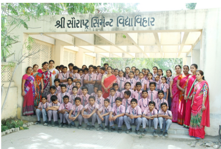
Shri Saurashtra Cement Vidyavihar, Ranavav

The Shri Saurashtra Cement Vidya Vihar School was started in 1980 with classes from KG to 2nd standard at Ranavav. Now with the classes upto 8th standard, the school has 425 students.