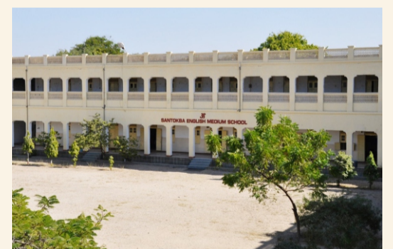
The Santokba English Medium School