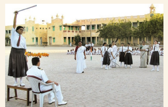
Archers garlanding a guest

The Gurukul education system is a quaint mix of ancient Indian culture and modern sciences. The Jawaharlal Nehru Planetarium and the Bharat Mandir were set up at Porbandar as a blending of the two. The Bharat Mandir has our history and cultural heritage depicted in paintings and quotes on the surrounding walls and pillars with a relief map of India in the center. Two more educational institutes were established for the girls residing within the city. The Santokba Vidya Mandir was established in 2006 followed by the Santokba English Medium School, based on the CBSE system, in 2012. Similarly, keeping alive the memory of Swami Dayanand Saraswati, Shri Nanjibhai built the Maharshi Dayanand Science College and donated it to the Education Society of Porbandar and thereafter detached himself from its management.