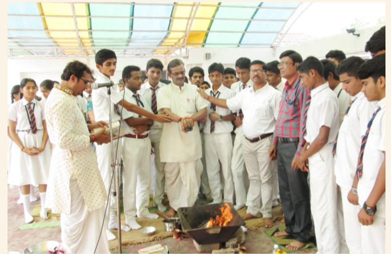
Yagya at NKDAV School