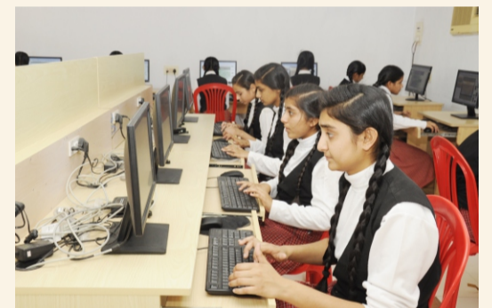
Technology in Education