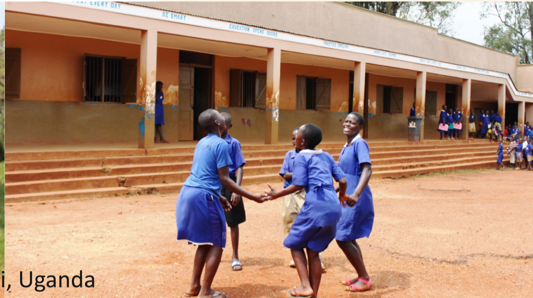
Schools in Lugazi, Uganda

The Sugar Corporation of Uganda, established in 1924 in Lugazi, runs 2 Nurseries, 13 Primary Schools, and 1 Secondary School for children of employees and surrounding areas. Scholarships were established in 2008 for deserving students who want to go in for higher studies. Over 6500 children are given an education at a subsidized fee in these schools. The school nurtures sporting talent and the accent on sports training achieved a record of sorts in Lugazi, when in 2012, an under 13 team won the regional title and played in the Little League World Baseball Series held in Pennsylvania, USA. They received thunderous applause when they came on the field and won the hearts of all the viewers