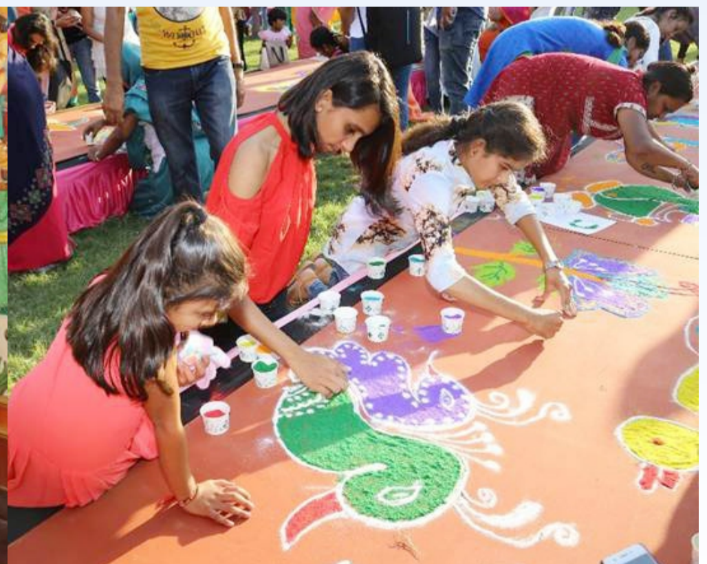
Participants busy at making rangolis at the Rangoli Competition