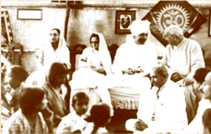
Where it all began - the Arya Kanya Gurukul inauguration