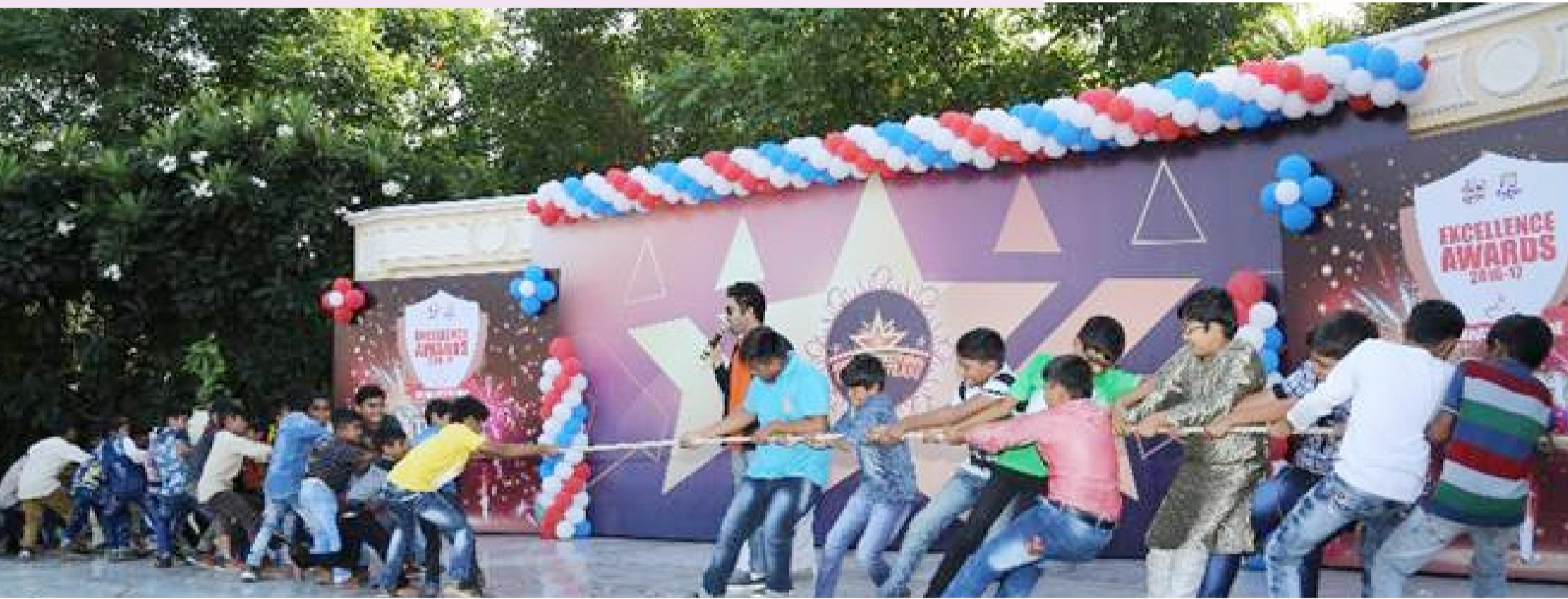
Tug of War between children of Channel Partners

Continuing with the tradition from the last few years we enjoyed a day together with the families of our Channel Partners during the auspicious festive period of Diwali. Various activities such as Rangoli Competition, a game of tug of war, Chhote Sitare singing and dancing competition and many other such fun-filled activities made the event memorable.