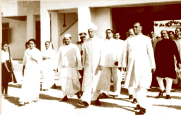
Dr Sarvapalli Radhakrishnan at the Gurukul